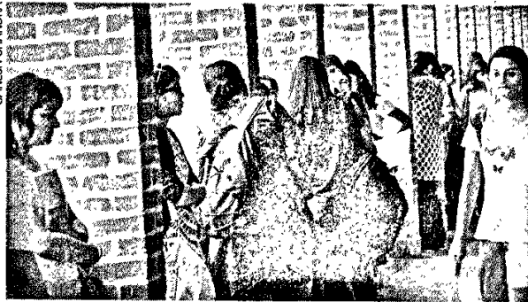
■ NCHER is the first step towards integration in higher education

The Union Cabinet's approval to set up the National Council for Higher Education and Research (NCHER) is being seen as a step forward by both the academia and industry. Diptiman Dewan reports